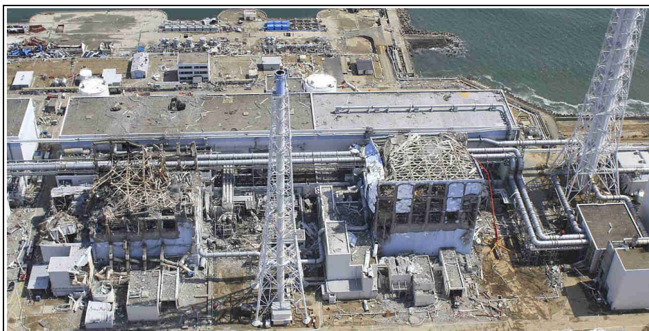
The blown out reactors at Fukushima, Japan, in March this year